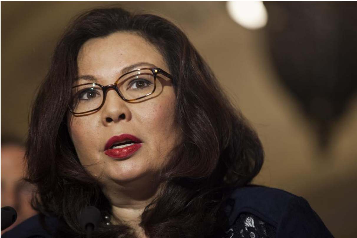
Senator Tammy Duckworth